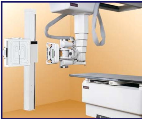
Upright procedure shown with OTS and self-centering wall cassette stand.

The overhead structure rides on stainless steel precision bearings and hardened steel tracks to ensure sturdy, vibration-free positioning. Electromagnetic locks control all movements. Individual lock releases are conveniently located on the user-friendly operator handle including a center mounted, single-button all-lock release for quick positioning of the tube in emergency situations. Solid-state liquid crystal displays on the operator handle provide clear visual indications of the Source Image Distance to the tabletop and bucky, as well as the tube angle. Designed to accommodate high patient volumes, the OTS maximizes efficiency and simplifies precise tube positioning.