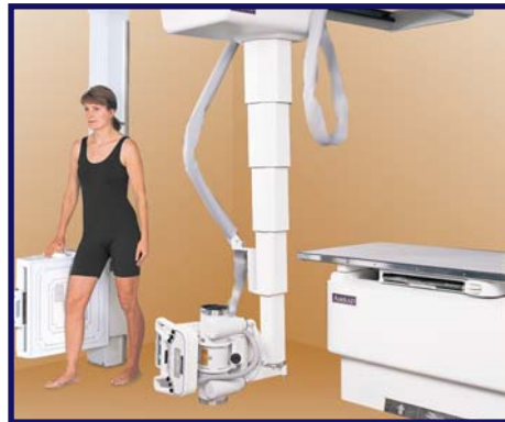
Weight bearing procedures shown with OTS and self-centering wall cassette stand.