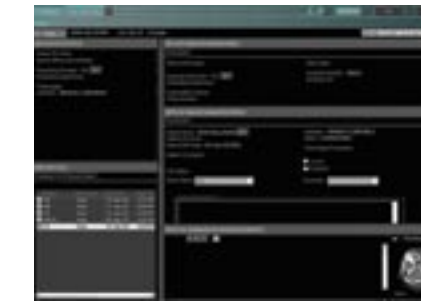
Integrated Text Area provides reports, technologist comments and patient information in a consolidated fashion.

Through a digital connection to modalities, departmental systems and hospital information systems, users within the healthcare enterprise can gain a consolidated view of patient data.