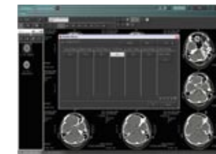
Scheduled worklists fits into the workflow of grand rounds and eases clinical review of cases.