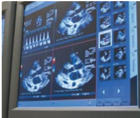
Flexible architecture separates client from server providing the foundation for the IMPAX client to be able to access multiple data sources with a single query.