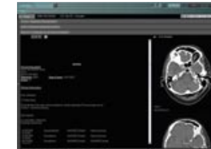
Key image display provides clinicians with a quick glance at relevant images in conjunction with the report.