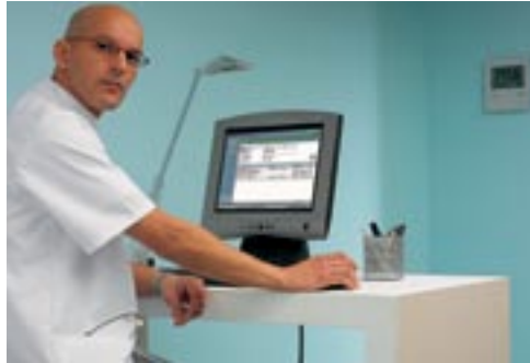
With easy installation and a secure connection via HTTPS, remote users gain reliable, secure access to their patient's information.